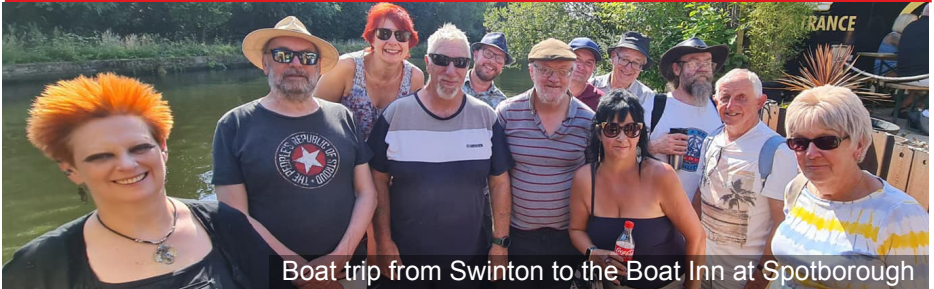
Boat trip from Swinton to the Boat Inn at Spotborough

Here are a few snapshots from CAMRA's latest socials.