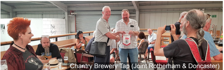
Chantry Brewery Tap (Joint Rotherham & Doncaster)