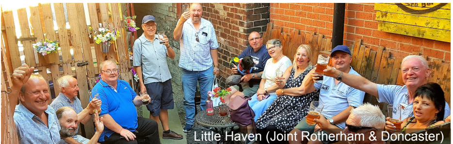
Little Haven (Joint Rotherham & Doncaster)