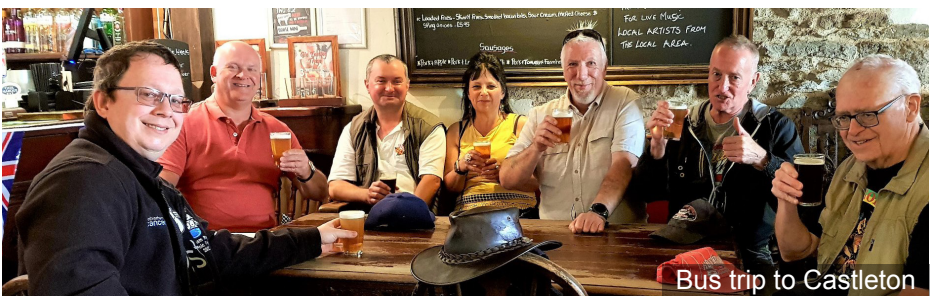
Bus trip to Castleton